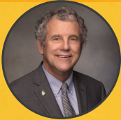
Sherrod Brown US Senator Ohio