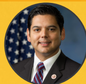
Raul Ruiz US Representative California