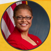
Karen Bass US Representative California