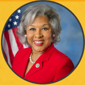
Joyce Beatty US Representative Ohio