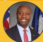
Tim Scott US Senator South Carolina