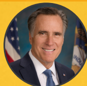
Mitt Romney US Senator Utah